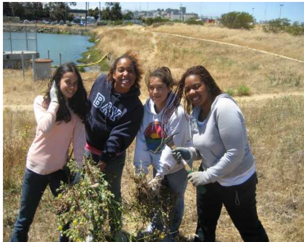
Summerbridge students help clean up at Heron Park

Summerbridge means so many things as a function of the fact that everyone involved is simultaneously learning and teaching. The teachers are learning to be teachers, learning from their students, and teaching from what they've learned as students themselves. The students are learning from their teachers, learning that it's cool to be a teacher, and teaching each other to take their role as a student seriously. As I said, it gets complicated quickly. But it's this complexity that makes Summerbridge such an important, dynamic place.” SB teacher